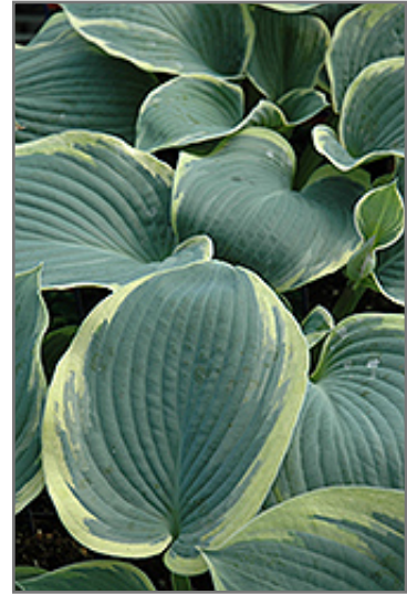
American Halo Hosta foliage

American Halo Hosta is recommended for the following landscape applications;