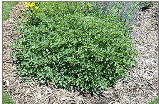
Japanese Bottlebrush