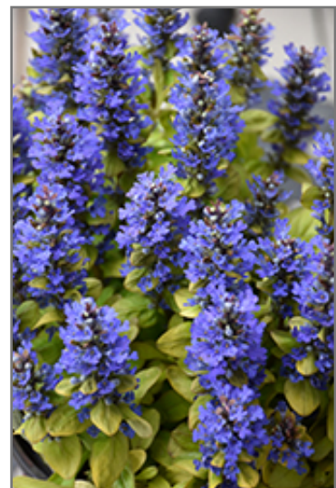
Feathered Friends Petite Parakeet Bugleweed flowers