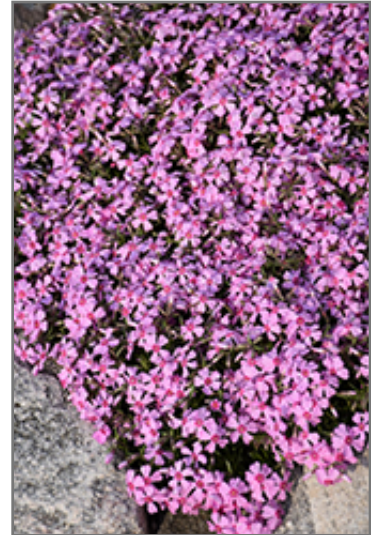
Eye Candy Creeping Phlox in bloom

Eye Candy Creeping Phlox is recommended for the following landscape applications;