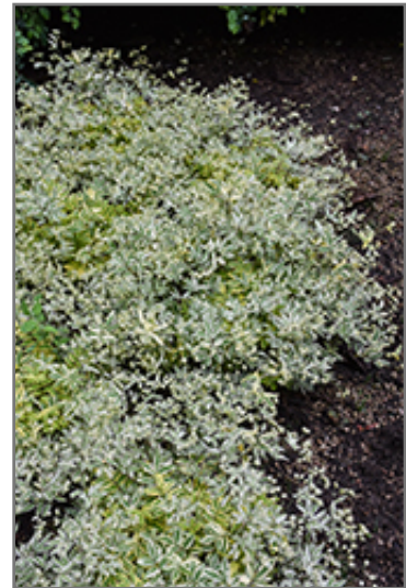
Golden Feathers Jacob's Ladder foliage

Golden Feathers Jacob's Ladder is recommended for the following landscape applications;