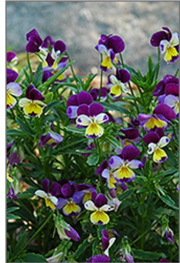
Johnny Jump-Up flowers