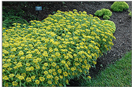
Aizoon Stonecrop in bloom