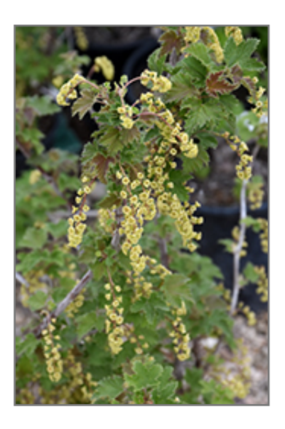
White Lake White Currant flowers