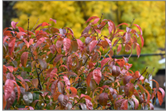
Muckle Plum in fall

This shrub should only be grown in full sunlight. It does best in average to evenly moist conditions, but will not tolerate standing water. It is not particular as to soil type or pH. It is highly tolerant of urban pollution and will even thrive in inner city environments. This particular variety is an interspecific hybrid.