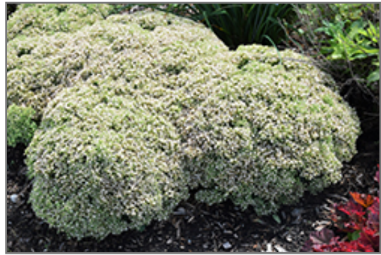
Rock 'N Round Bundle Of Joy Stonecrop in bloom

This is a relatively low maintenance plant, and is best cleaned up in early spring before it resumes active growth for the season. It is a good choice for attracting bees and butterflies to your yard, but is not particularly attractive to deer who tend to leave it alone in favor of tastier treats. It has no significant negative characteristics.