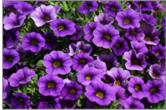
Calipetite Blue Calibrachoa flowers

This plant will require occasional maintenance and upkeep. Trim off the flower heads after they fade and die to encourage more blooms late into the season. It is a good choice for attracting bees and hummingbirds to your yard, but is not particularly attractive to deer who tend to leave it alone in favor of tastier treats. It has no significant negative characteristics.