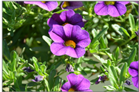
Calipetite Blue Calibrachoa flowers