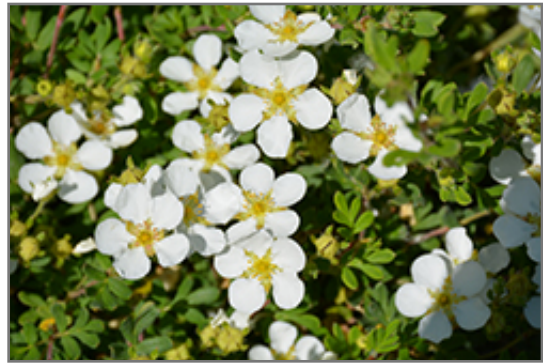
Happy Face White Potentilla flowers