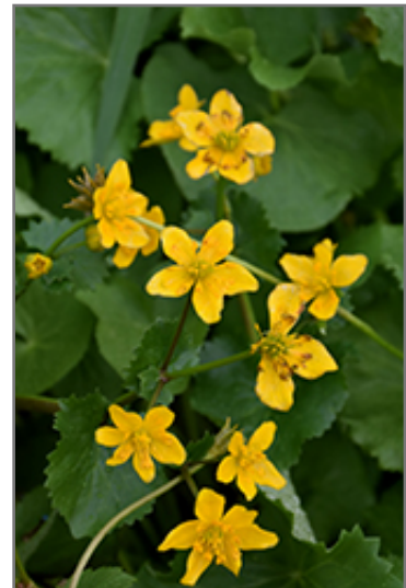
Marsh Marigold flowers