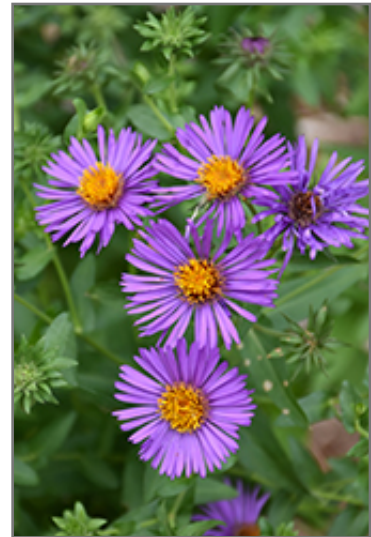
Purple Beauty Aster flowers