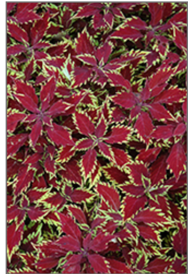
ColorBlaze Royale Apple Brandy Coleus foliage