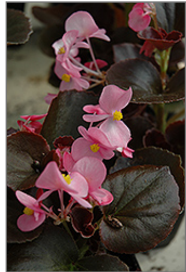
Cocktail Gin Begonia flowers