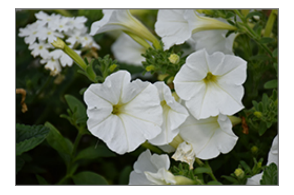
Supertunia White Petunia flowers