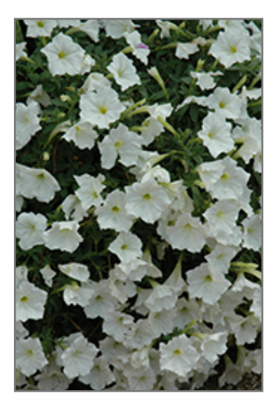
Supertunia White Petunia flowers