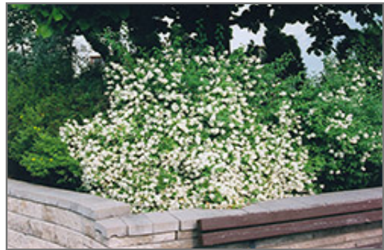
Galahad Mockorange in bloom