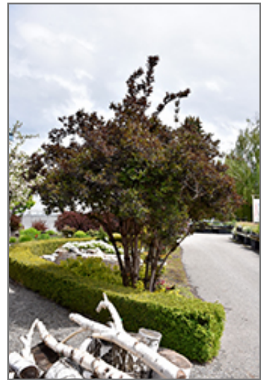
Black Beauty Elder