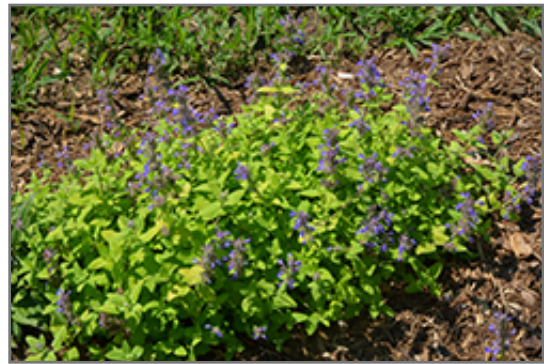
Chartreuse On The Loose Catmint in bloom