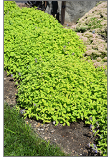
Chartreuse On The Loose Catmint