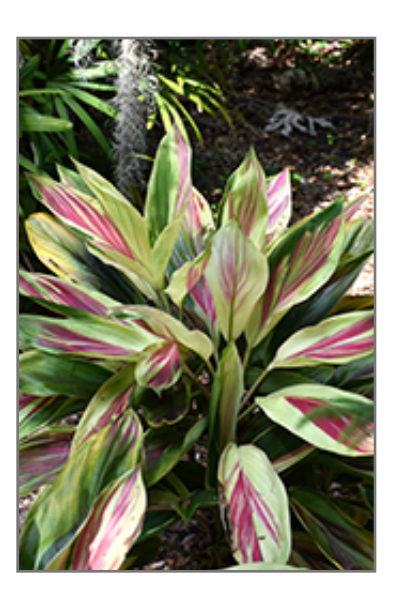
Exotica Hawaiian Ti Plant

When grown indoors, Exotica Hawaiian Ti Plant can be expected to grow to be about 4 feet tall at maturity, with a spread of 24 inches. It grows at a medium rate, and under ideal conditions can be expected to live for approximately 10 years. This houseplant will do well in a location that gets either direct or indirect sunlight, although it will usually require a more brightly-lit environment than what artificial indoor lighting alone can provide. It does best in average to evenly moist soil, but will not tolerate standing water. The surface of the soil shouldn't be allowed to dry out completely, and so you should expect to water this plant once and possibly even twice each week. Be aware that your particular watering schedule may vary depending on its location in the room, the pot size, plant size and other conditions; if in doubt, ask one of our experts in the store for advice. It will benefit from a regular feeding with a general-purpose fertilizer with every second or third watering. It is not particular as to soil type or pH; an average potting soil should work just fine.