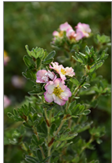
Happy Face Hearts Potentilla flowers