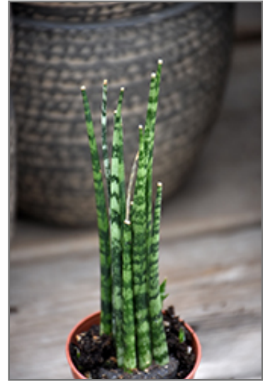
Mikado Cylindrical Snake Plant

When grown indoors, Mikado Cylindrical Snake Plant can be expected to grow to be about 3 feet tall at maturity, with a spread of 18 inches. It grows at a slow rate, and under ideal conditions can be expected to live for approximately 10 years. This houseplant will do well in a location that gets either direct or indirect sunlight, although it will usually require a more brightly-lit environment than what artificial indoor lighting alone can provide. It prefers dry to average moisture levels with very well-drained soil, and may die if left in standing water for any length of time. This plant should be watered when the surface of the soil gets dry, and will need watering approximately once each week. Be aware that your particular watering schedule may vary depending on its location in the room, the pot size, plant size and other conditions; if in doubt, ask one of our experts in the store for advice. It is not particular as to soil pH, but grows best in sandy soil. Contact the store for specific recommendations on pre-mixed potting soil for this plant. Be warned that parts of this plant are known to be toxic to humans and animals, so special care should be exercised if growing it around children and pets.