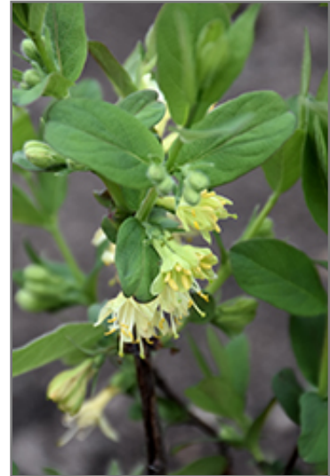
Boreal Blizzard Honeyberry flowers

This shrub is quite ornamental as well as edible, and is as much at home in a landscape or flower garden as it is in a designated edibles garden. It does best in full sun to partial shade. It prefers dry to average moisture levels with very well-drained soil, and will often die in standing water. It is not particular as to soil type or pH. It is highly tolerant of urban pollution and will even thrive in inner city environments. This is a selected variety of a species not originally from North America.