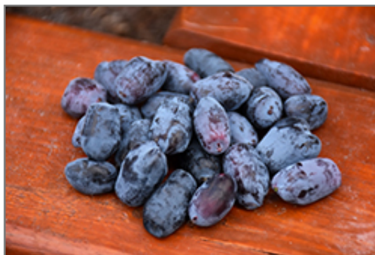
Boreal Blizzard Honeyberry fruit

Boreal Blizzard Honeyberry features subtle chartreuse flowers along the branches in early spring. It has green deciduous foliage. The narrow leaves do not develop any appreciable fall colour. It features an abundance of magnificent navy blue berries with powder blue overtones from early to mid summer.