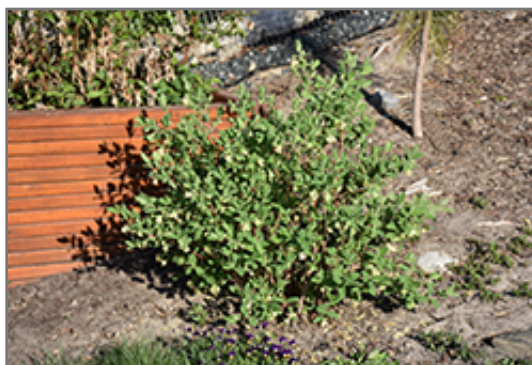
Boreal Blizzard Honeyberry in bloom