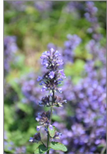
Cat's Pajamas Catmint flowers

Cat's Pajamas Catmint is recommended for the following landscape applications;