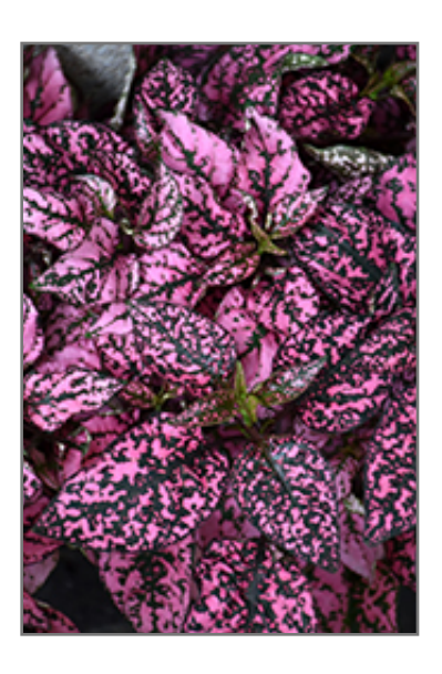
Splash Select Pink Polka Dot Plant foliage

When grown indoors, Splash Select Pink Polka Dot Plant can be expected to grow to be about 12 inches tall at maturity, with a spread of 12 inches. It grows at a fast rate, and under ideal conditions can be expected to live for approximately 5 years. This houseplant will do well in a location that gets either direct or indirect sunlight, although it will usually require a more brightly-lit environment than what artificial indoor lighting alone can provide. It does best in average to evenly moist soil, but will not tolerate standing water. The surface of the soil shouldn't be allowed to dry out completely, and so you should expect to water this plant once and possibly even twice each week. Be aware that your particular watering schedule may vary depending on its location in the room, the pot size, plant size and other conditions; if in doubt, ask one of our experts in the store for advice. It is not particular as to soil type or pH; an average potting soil should work just fine.