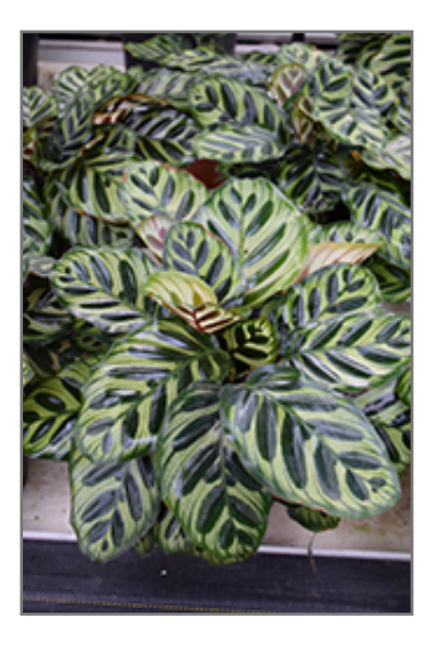
Peacock Plant in full

When grown indoors, Peacock Plant can be expected to grow to be about 24 inches tall at maturity, with a spread of 18 inches. It grows at a slow rate, and under ideal conditions can be expected to live for approximately 5 years. This houseplant should only be grown away from direct sunlight or in a room with strong artificial light. It does best in average to evenly moist soil, but will not tolerate standing water. The surface of the soil shouldn't be allowed to dry out completely, and so you should expect to water this plant once and possibly even twice each week. Be aware that your particular watering schedule may vary depending on its location in the room, the pot size, plant size and other conditions; if in doubt, ask one of our experts in the store for advice. It is not particular as to soil pH, but grows best in rich soil. Contact the store for specific recommendations on pre-mixed potting soil for this plant.