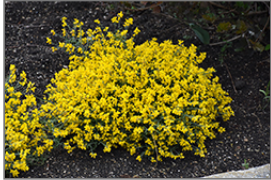
Bangle Dyers Greenwood in bloom