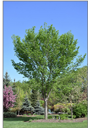
Brandon Elm