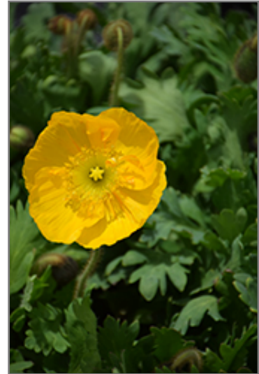
Champagne Bubbles Yellow Poppy flowers

Champagne Bubbles Yellow Poppy is an open herbaceous perennial with tall flower stalks held atop a low mound of foliage. It brings an extremely fine and delicate texture to the garden composition and should be used to full effect.