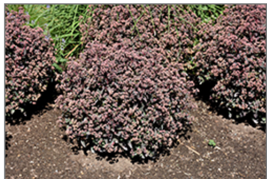
Rock 'N Grow Tiramisu Stonecrop in bloom