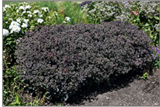
Night Light Stonecrop in bloom

Night Light Stonecrop is recommended for the following landscape applications;