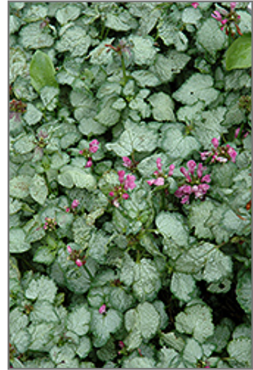
Beacon Silver Spotted Dead Nettle flowers