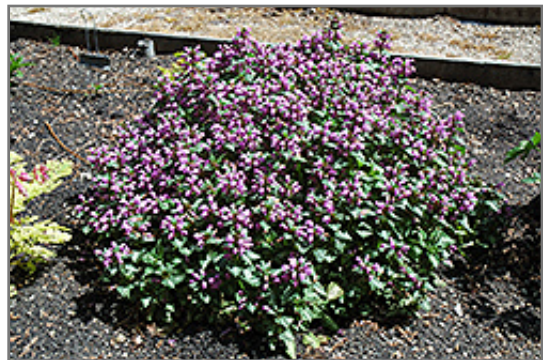
Beacon Silver Spotted Dead Nettle in bloom