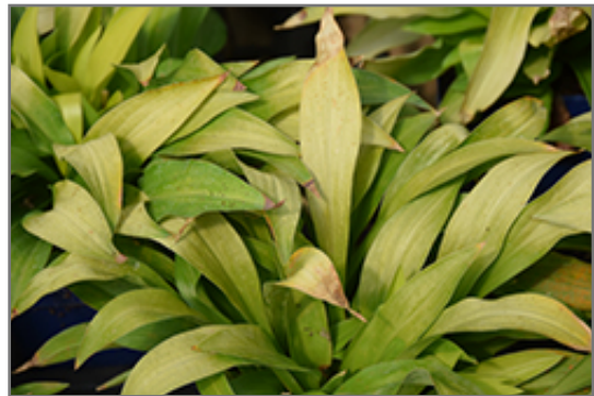
Munchkin Fire Hosta foliage