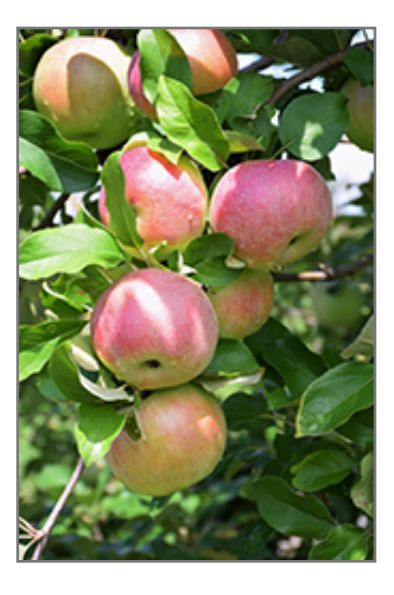
Northern Spy Apple fruit