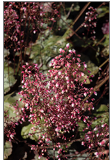
Frosted Violet Coral Bells flowers