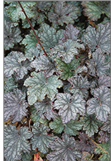
Frosted Violet Coral Bells foliage

This is a relatively low maintenance plant, and should be cut back in late fall in preparation for winter. It is a good choice for attracting hummingbirds to your yard. It has no significant negative characteristics.