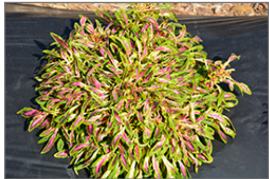
Fancy Feathers Pink Coleus