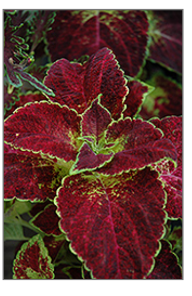
ColorBlaze Dipt in Wine Coleus foliage