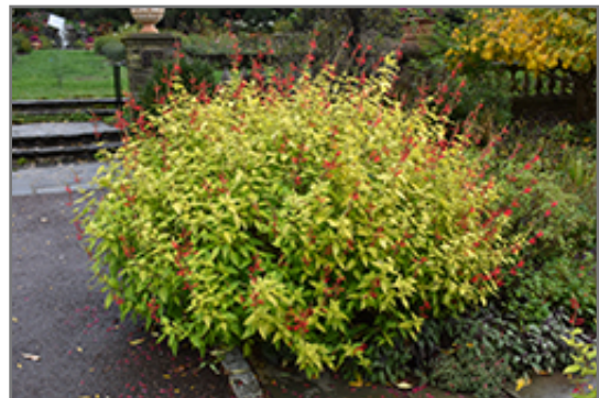
Golden Delicious Pineapple Sage in bloom