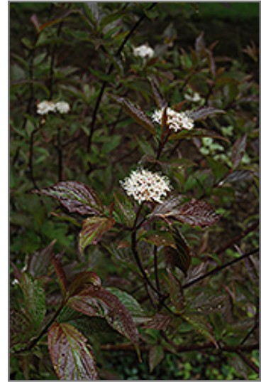
Kesselring Dogwood flowers

Kesselring Dogwood will grow to be about 6 feet tall at maturity, with a spread of 6 feet. It tends to fill out right to the ground and therefore doesn't necessarily require facer plants in front, and is suitable for planting under power lines. It grows at a fast rate, and under ideal conditions can be expected to live for approximately 20 years.