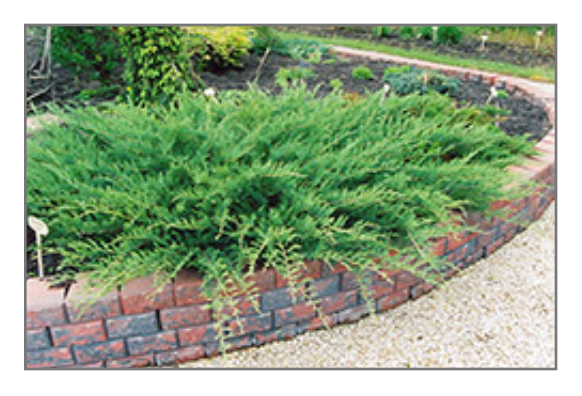
Blue Danube Juniper