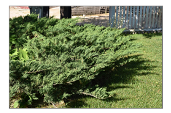
Blue Danube Juniper