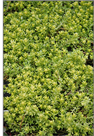
Golden Moss Stonecrop foliage