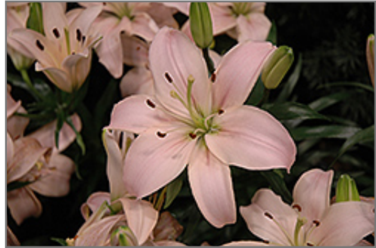
Lily Looks Tiny Athlete Lily flowers

These naturally dwarf early blooming lilies are perfect for garden containers, massing, or border plantings; they tend to have more blooms per stem than most lilies which will definitely make an impact in the garden