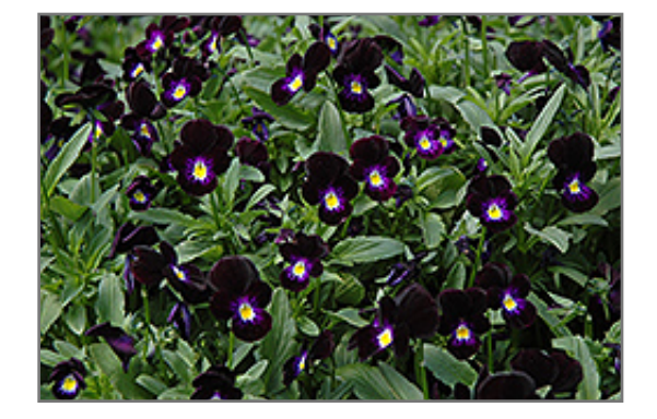
Bowles Black Pansy flowers