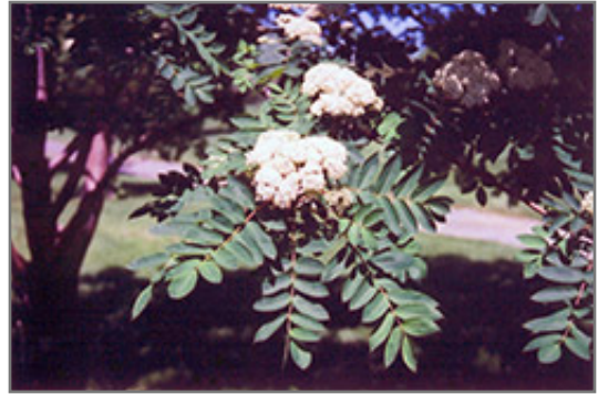
Showy Mountain Ash flowers

This tree should only be grown in full sunlight. It is very adaptable to both dry and moist locations, and should do just fine under average home landscape conditions. It is not particular as to soil type or pH. It is highly tolerant of urban pollution and will even thrive in inner city environments. This species is native to parts of North America.