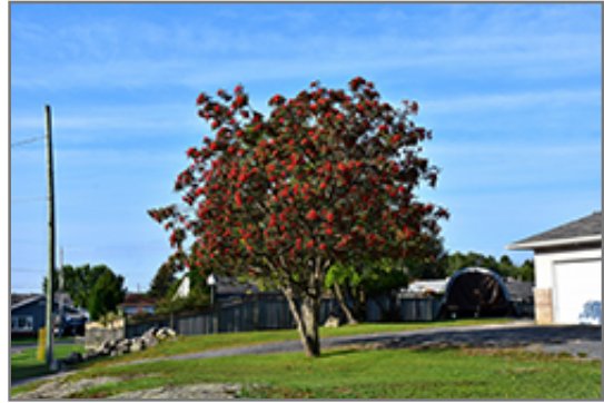
Showy Mountain Ash fruit