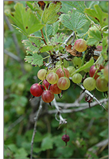
Pixwell Gooseberry fruit

This is a multi-stemmed deciduous shrub with an upright spreading habit of growth. Its average texture blends into the landscape, but can be balanced by one or two finer or coarser trees or shrubs for an effective composition. This plant will require occasional maintenance and upkeep, and is best pruned in late winter once the threat of extreme cold has passed. It is a good choice for attracting birds and butterflies to your yard. It has no significant negative characteristics.