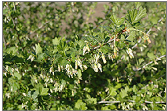
Pixwell Gooseberry flowers