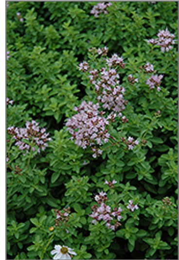
Dwarf Oregano flowers

Aside from its primary use as an edible, Dwarf Oregano is suitable for the following landscape applications;