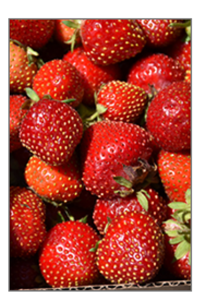
Fort Laramie Strawberry fruit

is a self-pollinating variety, so it doesn't require a second plant nearby to set fruit.