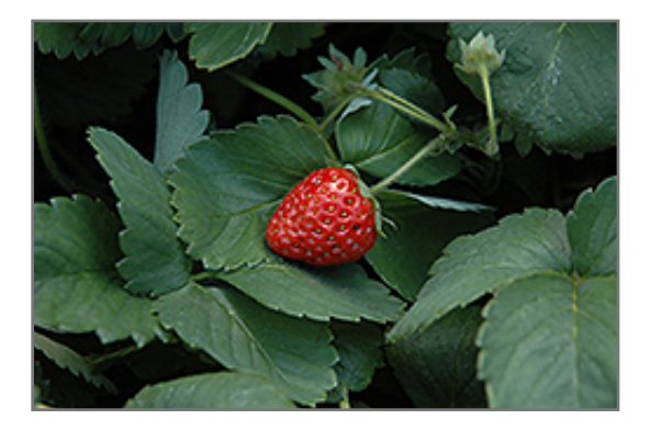
Fort Laramie Strawberry fruit

Fort Laramie Strawberry features dainty white daisy flowers with yellow eyes along the stems from late spring to mid summer. Its tomentose round compound leaves remain green in colour throughout the season. It features an abundance of magnificent scarlet berries from early to late summer.