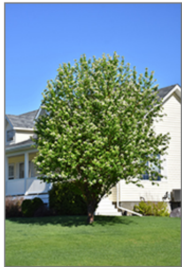
Amur Cherry