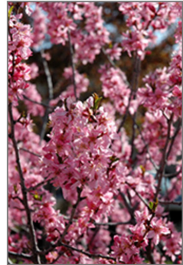
Muckle Plum (tree form) flowers